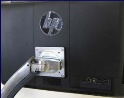
(Desk Mount Arm Not Included)

Provides the ability to remove the stand and attach the HP Compaq 8200 Elite All-in-One to VESA compliant mounting devices, such as a wall mount or desk mount arm, that provides the VESA 100 attachment (100mm x 100mm).